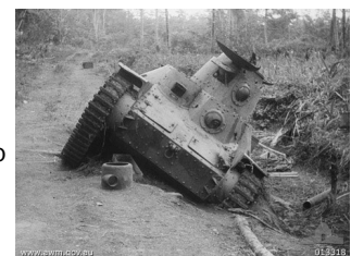
One of the knocked out Japanese Type 95 Tank at the Battle of Milne Bay