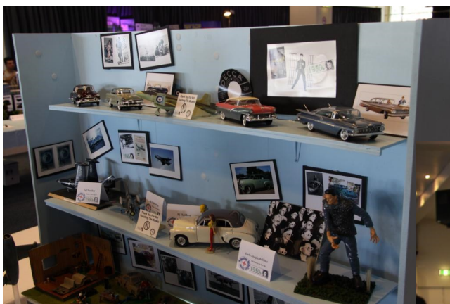
A couple of shots of our Model Expo Display "The 1950s a Decade of Change"

Fantastic work by members of PMG—The Group is always looking for new members