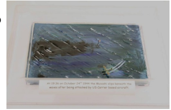
When our Theme build of the Musashi couldn't be completed, Graham decided to do a little diorama on what happened to it instead

"Transferring automatically the details of the post on to the operators Facebook page."