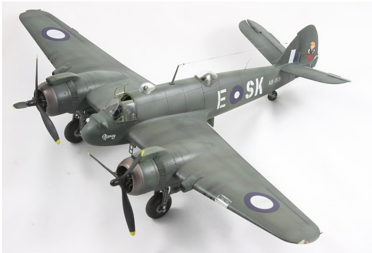
Beaufighter Mk21 Ginger Meggs aka Nancy 93 Sqn 1945