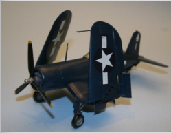
F4U-1D one of the Theme models for the recent Waverly Interclub